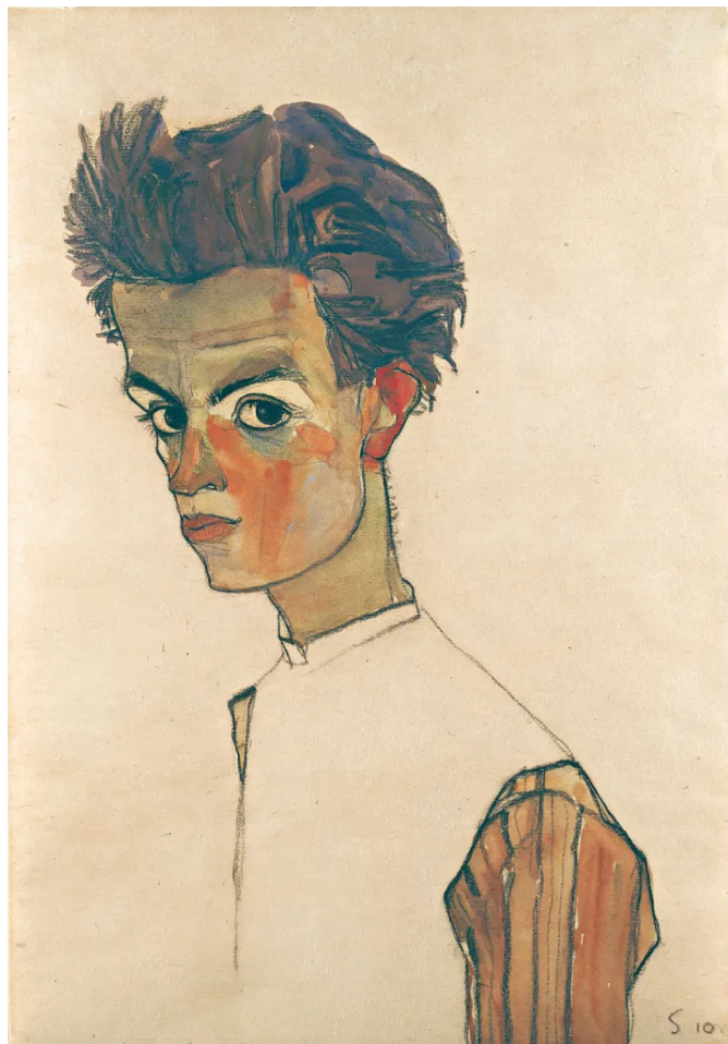
Self-Portrait with Striped Shirt, 1910

How do you think Schiele has used composition to portray his confidence in the painting Self-Portrait with Striped Shirt?