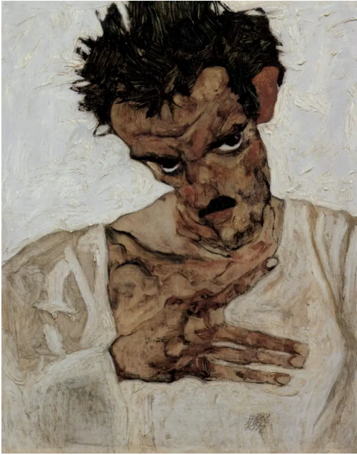
Selbstporträt mit gesenktem Kopf, 1912. [Self-Portrait with Lowered Head]