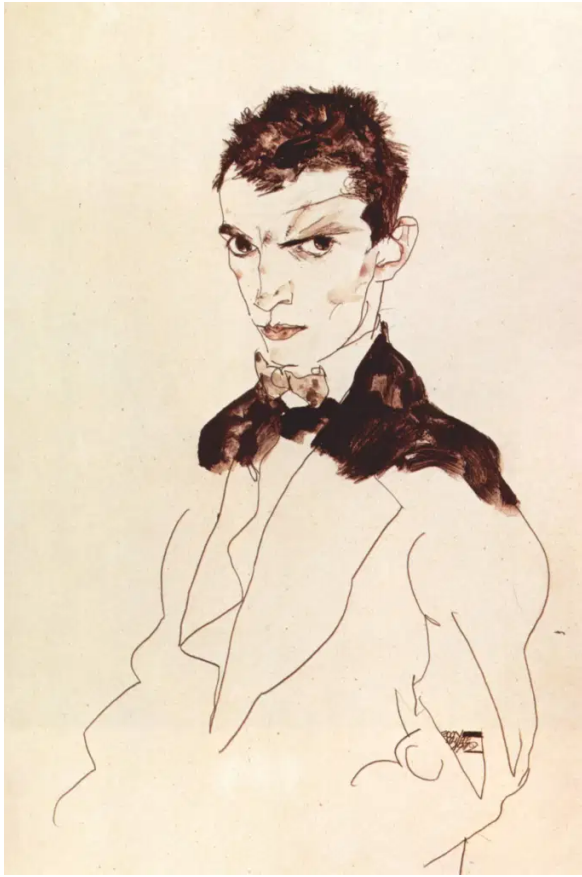
Selbstportät, 1912 [Self-Portrait]