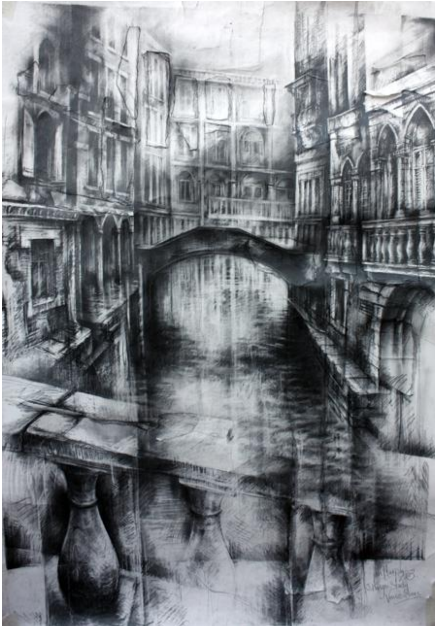
Three Kings in the Chasm. Graphite & collage on paper 160 x 110cm approx