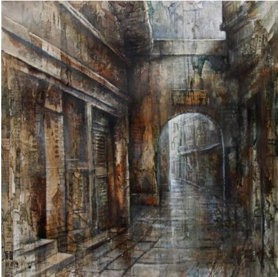
Heading East. Oil and mixed media on paper 41cm x 41cm