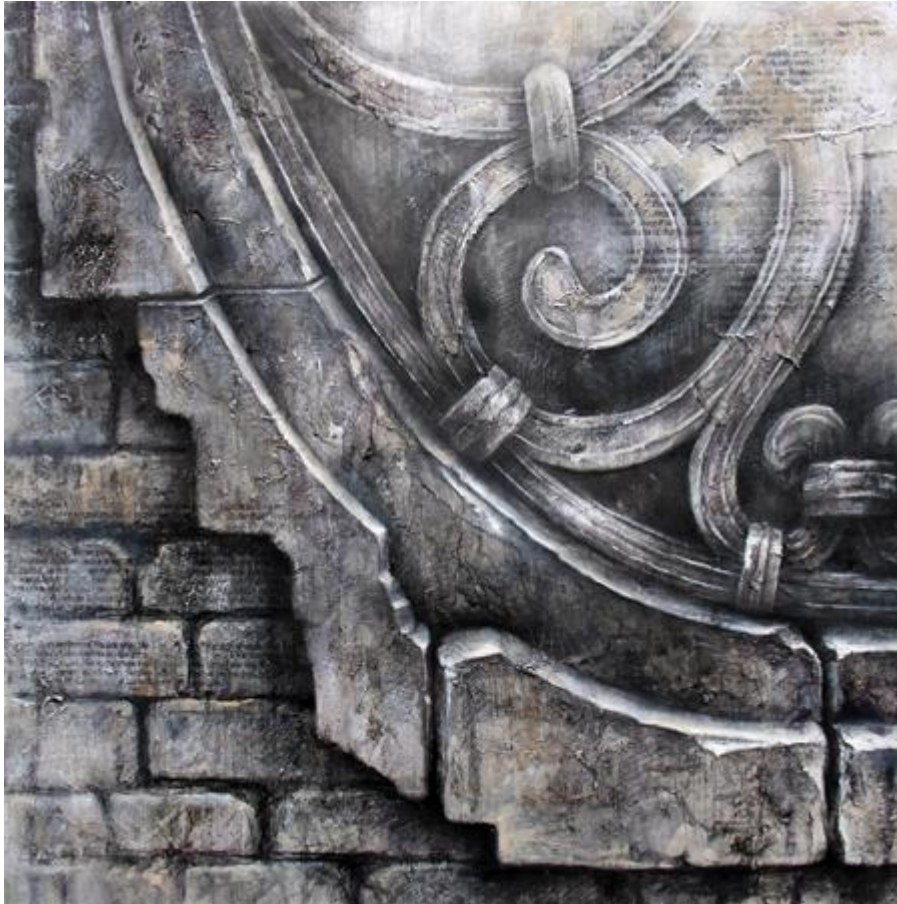
Venetian Scroll. Oil paint, mixed media & Graphite on paper 75cm x 75cm

to draw and think about his ideas, he makes large-scale work and uses lots of materials to create distressed surfaces that he paints and draws over the top of.