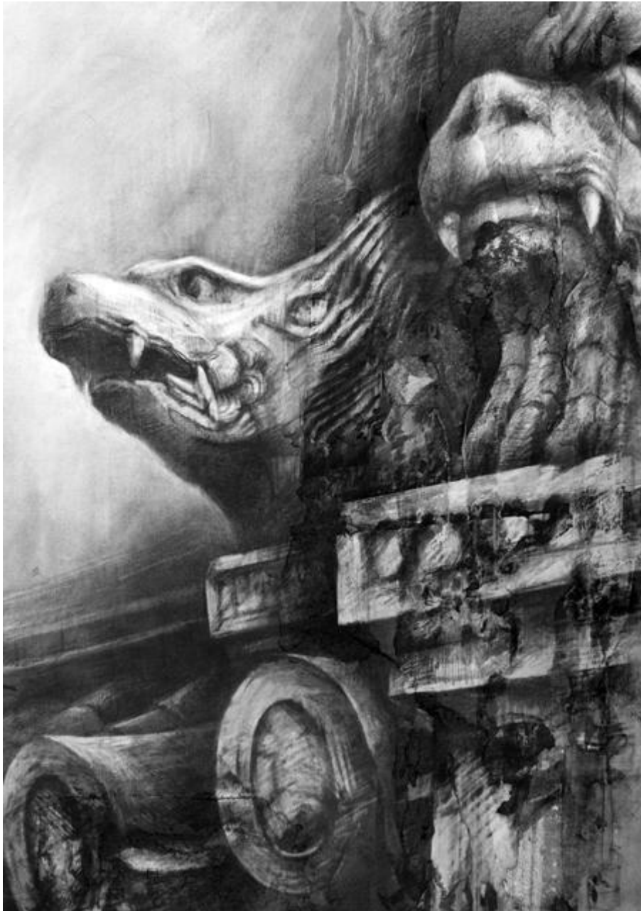
Vigilant and Proud. Graphite & mixed media on paper 110cm x 94cm