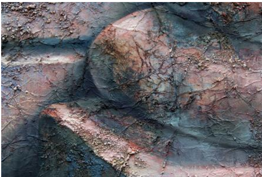
Cascade of Light. Oil paint, mixed media on canvas 92cm x 92cm

If you look very carefully at Ian Murphy's paintings, you will notice a lot of subtle, pastel colours on top of rich layers of textures. The use of a rough surface adds to the 'aged' effect, and gives us an impression of the location that inspired the artwork. It is very clear what the subject is, but sometimes Ian Murphy's use of colour could be described as abstract. Although the colours have been exaggerated,